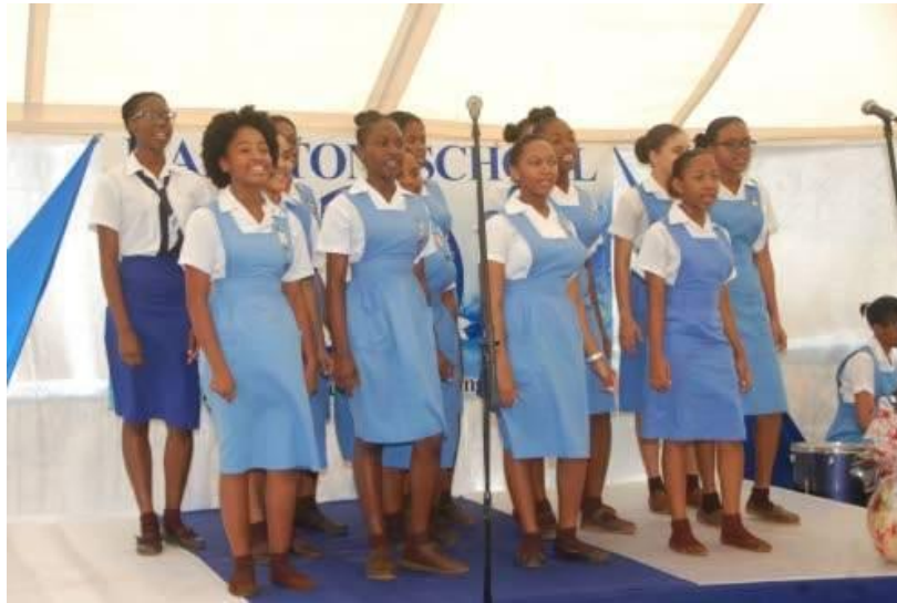
Hampton School Choir performs 160 th anniversary song.

MALVERN, St Elizabeth — Iconic all-girls' school Hampton last year celebrated the 160th anniversary of its establishment by the Munro and Dickenson Trust.